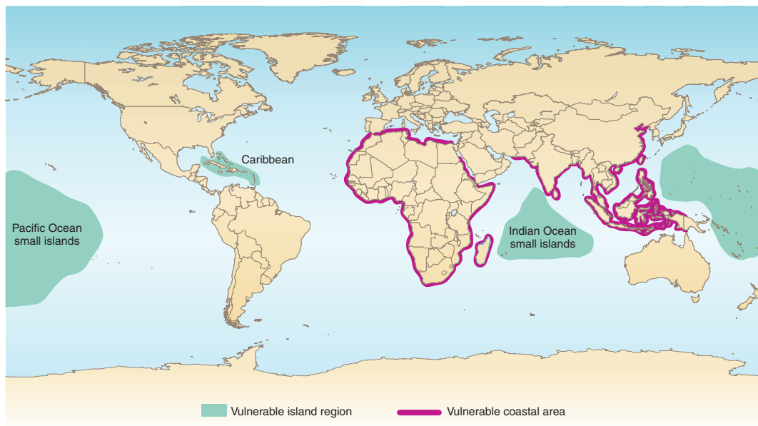
Fig. 3. Several regions are vulnerable to coastal flooding caused by future relative or climate-induced sea-level rise. At highest risk are coastal zones with dense populations, low elevations, appreciable rates of subsidence, and/or inadequate adaptive capacity.

Many impact studies do not consider adaptation, and hence determine worst-case impacts [e.g., (42)]. Yet, the history of the human relationship with the coast is one of an increasing capacity to adapt to adverse change [e.g., (43)]. In addition, the world’s populated coasts became increasingly managed and engineered over the 20th century (35). The subsiding cities discussed above all remain protected to date, despite large relative SLR. Analysis based on benefit-cost methods show that protection would be widespread as well-populated coastal areas have a high value and actual impacts would only be a small fraction of the potential impacts [e.g., (44)], even assuming high-SLR (>1 m/century) scenarios (45). This suggests that the common assumption of a widespread forced retreat from the shore in the face of SLR is not inevitable. In many densely populated coastal areas, communities advanced the coast seaward via land claim owing to the high value of land (e.g., Singapore). Yet, protection often attracts new development in low-lying areas, which may not be desirable, and coastal defense failures have occurred, such as New Orleans in 2005. Hence, we must choose between protection, accommodation, and planned retreat adaptation options (35). This choice is both technical and sociopolitical, addressing which measures are desirable, affordable, and sustainable in the long term. Adaptation remains a major uncertainty concerning the actual impacts of SLR.